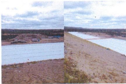
( Cell #3 under construction)

In 2020, Central Regional Service Board, with the assistance of the Dept. of Environment, and Climate Change, constructed a 3rd lined landfill attached to the existing cell for continued leachate treatment. Since January 2021 this new cell disposed of waste form both Central & Western Regional Service Boards.